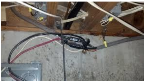
How is your house wired?

"For the wages of sin is death; but the gift of God is eternal life through Jesus Christ our Lord." Rom 2:23 "And be not conformed to this world but be ye transformed.." Rom 12:2 "Marvel not that I said unto thee, Ye must be born again." John 3:7 "Therefore if any man be in Christ, he is a new creature: old things are passed away; behold, all things are become new." II Cor. 5:17