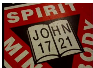
People at York Y must step on this.

“Ye make clean the outside of the cup and of the platter, but within they are full of extortion and excess... Cleanse first that which is within the cup and platter, that the outside of them may be clean also.” Matt23:25,26