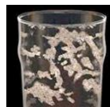
First clean inside with Jesus.

“For ye have the poor always with you; but me ye have not always.” Mat 26:11