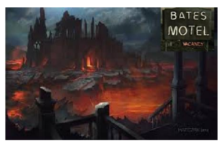
Once arriving you cannot leave.