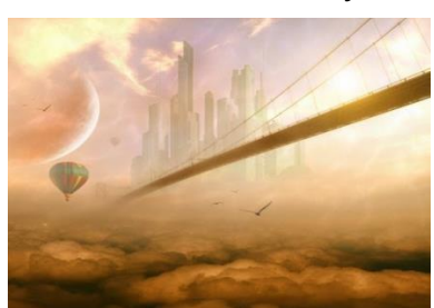
You will never want to leave.

Make that call today while you still can be assured of the right reservation. It is a free offer.