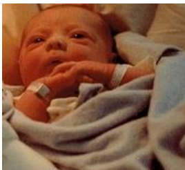
Our first-born son.

“For unto us a Child is born, unto us a Son is given: and the government shall be upon His shoulder: and His name shall be called Wonderful, Counsellor, The mighty God, The everlasting Father, The Prince of Peace.” Isaiah 9:6