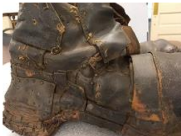
The sole I helped saved.

We may have many soles but we only have one soul. When God created man, “he breathed into his nostrils the breath of life and man became a living soul.” Gen 2:7 The soul of man is not a physical part of the human body. It consists of the nontangible functions of existing like feelings, thoughts, emotions, and actions. It confers individuality and humanity to all of us. When the soul leaves the body, the body no longer has life. The soul is created at conception and never dies. The soul is what will stand before God to be judged. “And as it is appointed unto men once to die, but after this the judgment.” Heb 9:27 “Whosoever was not found written in the book of life was cast into the lake of fire. Rev 20:15 “Let him know, that he which converteth the sinner from the error of his way shall save a soul from death,” James 5:20 “How then shall they call on Him in whom they have not believed? And how shall they believe in Him of whom they have not heard?” Rom 10:14 Lord, here I am use me to help save a soul, today.