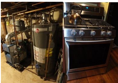
Our 2018 New New New

Our new items from 2018 will soon be scratched, broken down and will become obsolete. However, our new life in Christ will never become obsolete. It will last throughout eternity. Each day can be a new and exciting walk with our Lord. "They are new every morning, great is thy faithfulness." Lam 3:23