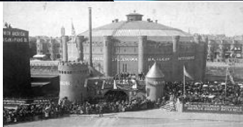
Cyclorama of Gettysburg 1884