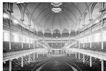
1854 Metropolitan Tabernacle 5,000 seats + 1,000 standing

“And so were the churches established in the faith, and increased in number daily.” Acts 16:5